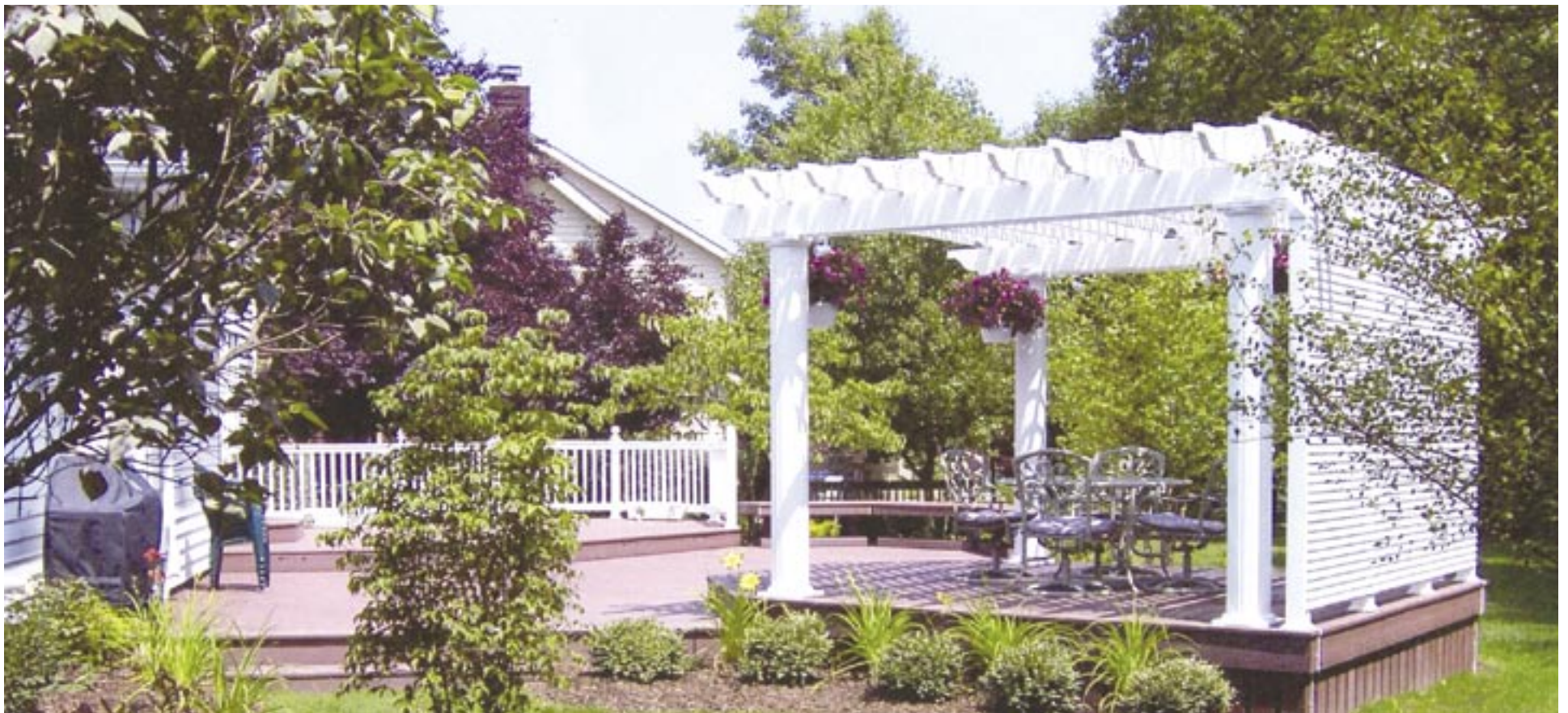
Rzonga Construction helps homeowners expand their living space to the outdoors with dramatic decks, patios, gazebos and more.