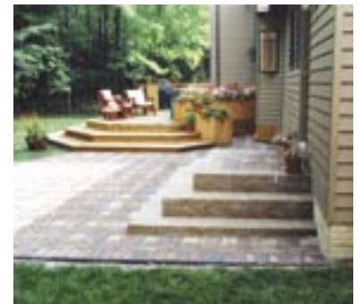
The right deck begins with a proper design driven by each the homeowners’ unique lifestyle.